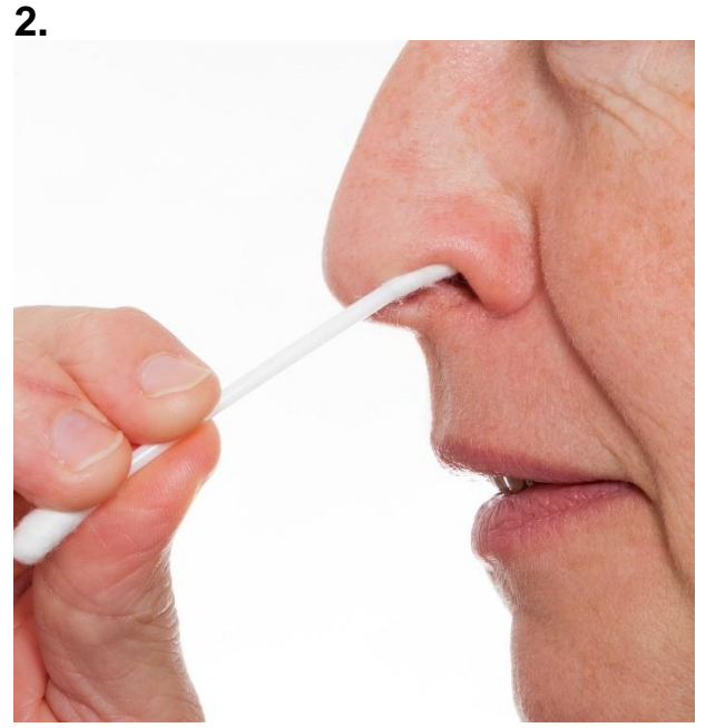
Apply the ointment to the first cm of one nostril and make sure that is is spread evenly.