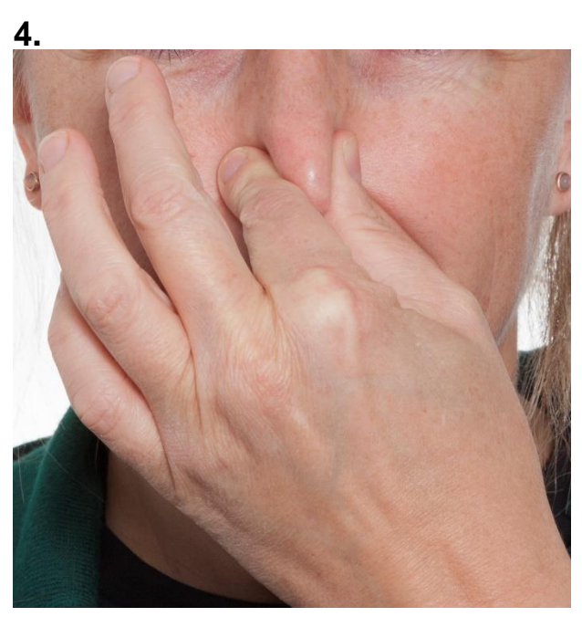
Now gently press the sides of your nostrils together to spread the ointment on your nose.