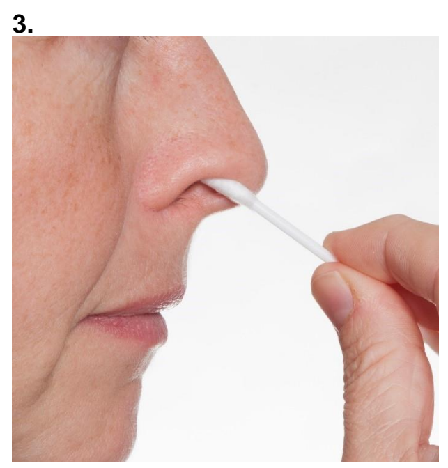
Turn the Q-Tip and place a similar amount of ointment on it and apply it to the other nostril. Dispose of the Q-Tip.